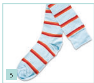
5. OE Field Game Socks.