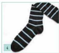
4. OE Socks Cotton/Lycra, one size