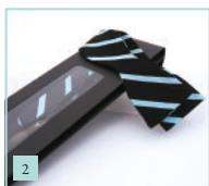
2. OE Bow Tie Silk, self tie