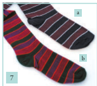
7. a. Viking Socks. b. Rambler Socks