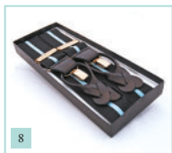
8. OE Braces Real leather brace ends, gilt steel fittings, multi fit