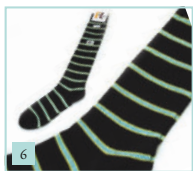
6. Pop Socks.