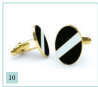
10. OE Cufflinks with gift box