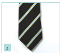
3. Pop Tie Silk, in Pop colours