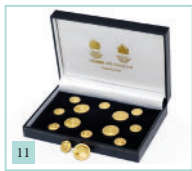
11. OEA Buttons Set of 12 or 14.