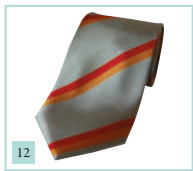
12. OE Field Game Society Tie Silk