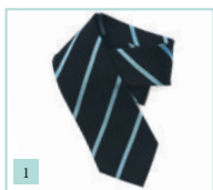
1. OE Tie Silk, in OE colours.