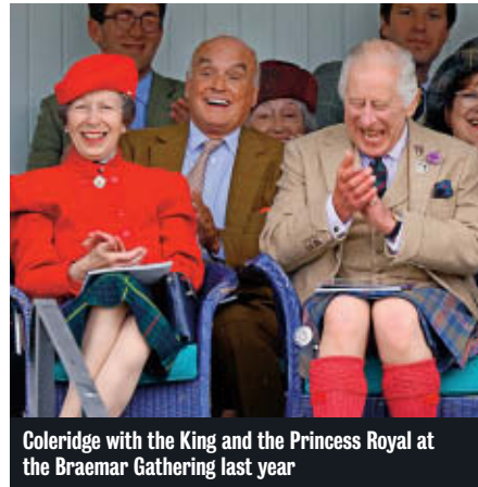
Coleridge with the King and the Princess Royal at the Braemar Gathering last year

He's right, people are fascinated by the place, even if many view it as everything that is wrong about the class system in Britain. Eton, of all the public schools, is seen as the ultimate toff destination. It's partly the uniform – those tails, the pinstriped trousers and waistcoat – but