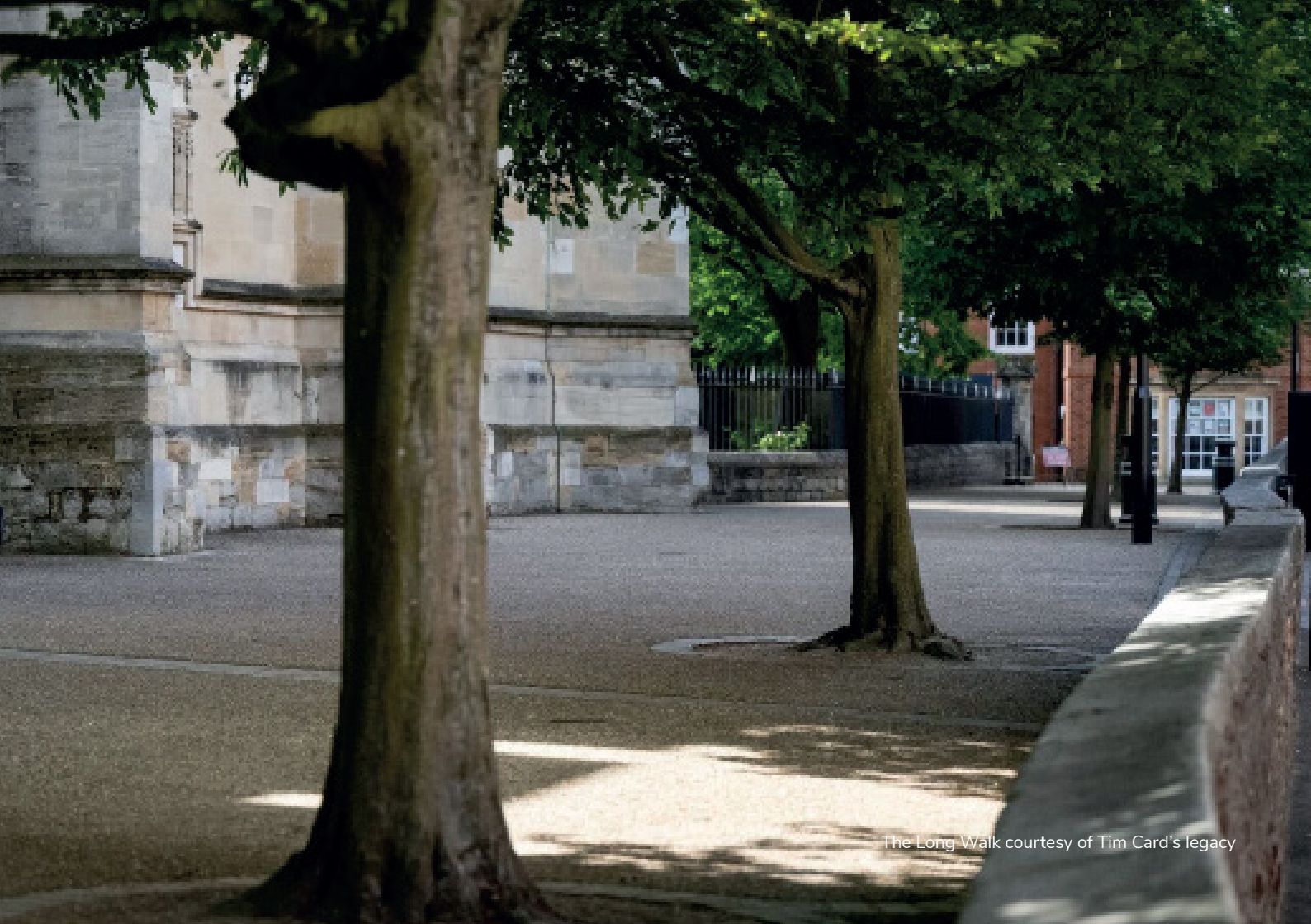
The Long Walk