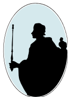
HENRY VI SOCIETY

All those who leave or intend to leave a legacy to Eton are eligible to join the Henry VI Society.